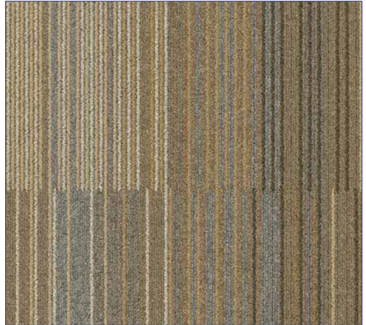
100217 Flash Back