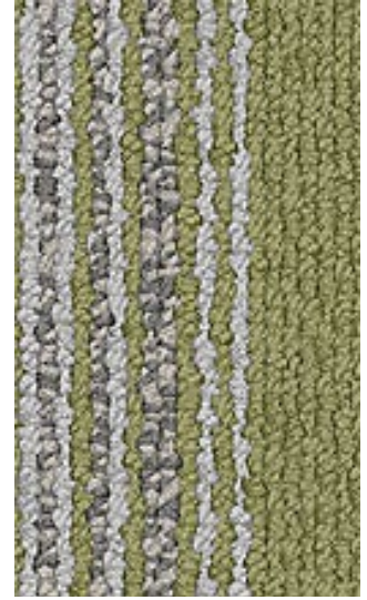
4109 Shelburne | 4109 Shelburne Fern (accent color)