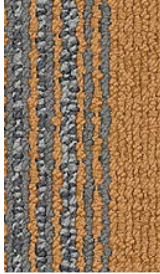
4109 Woodstock | 4109 Woodstock Fallen Leaves (accent color)