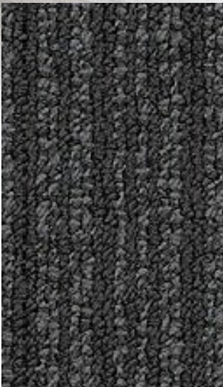
4109 Manchester | 4109 Manchester Mountain Sky (accent color)

SHADOWFX SDC — CONSTRUCTED OF PREMIUM BRANDED YARN FOR DEMANDING ESD APPLICATIONS AND 24/7 ENVIRONMENTS.