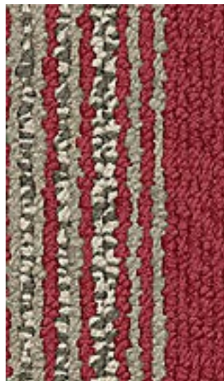
4109 Pomfret | 4109 Pomfret Red Barn (accent color)