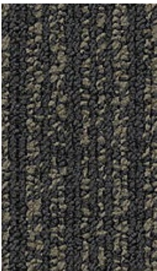
4109 Bennington | 4109 Bennington Fern (accent color)