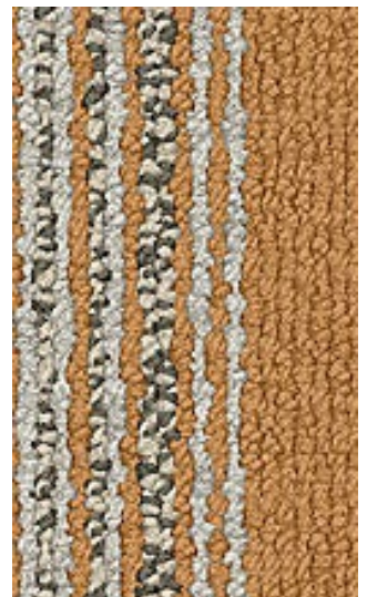
4109 Waitsfield | 4109 Waitsfield Fallen Leaves (accent color)