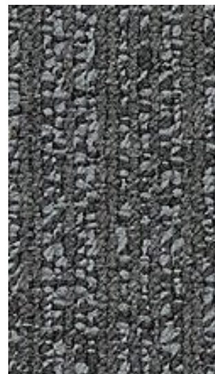
4109 Dorset | 4109 Dorset Red Barn (accent color)