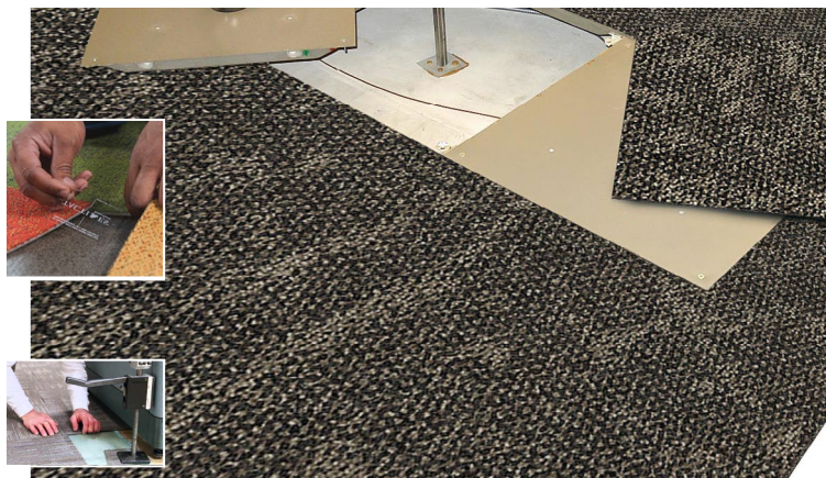
Floating ShadowFX carpet tile installed over access flooring