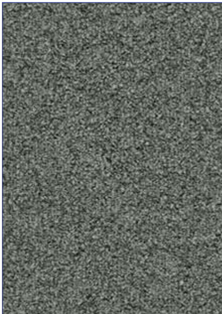
4116 El Capitan 24"