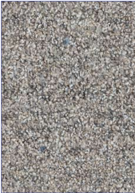
4114 Chesapeake Sandbar 24"