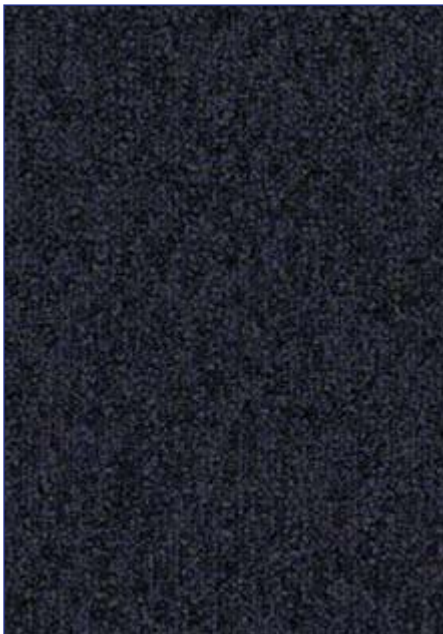
4117 Allaghash 24"