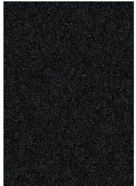
4118 Moloaa Beach Rock 24"