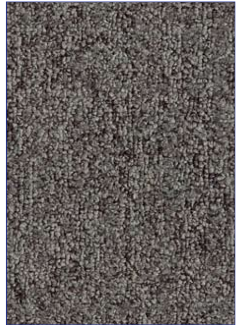
4115 Huntington Ravine 24"