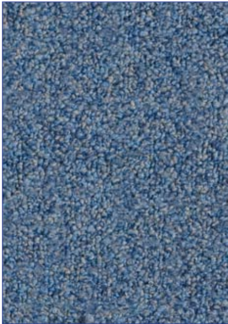
4113 Thunder Bay 24"